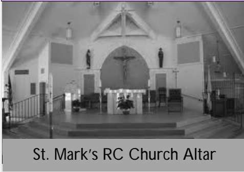
St. Mark's RC Church Altar

I'm looking forward to our April fundraiser. I know it will be a success. You are a great group of dedicated ladies! Thanks for all that you do in helping St. Mark and our community.